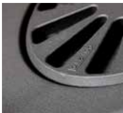
Cast iron disc grate in base for easy ash removal