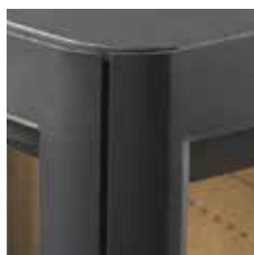
Elegant rounded corners