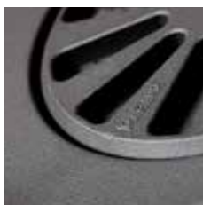
Cast iron disc grate in base for easy ash removal