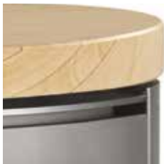
Accessory: Sandstone top