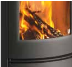
Combustion chamber designed to make it easy to light and clean the stove

The Shape 2 also offers the option of complementing the stove with either a beautiful Soapstone or Sandstone top, creating a stunning centrepiece for your room.