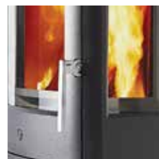
Side windows for an increased flame visual