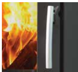
Ergonomically designed handles