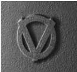
Door, top plate, grate and flue made of high-quality cast iron