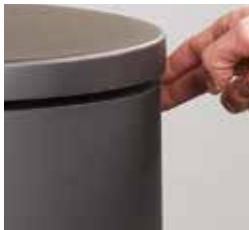
Ergonomically correct adjustment of the air vent