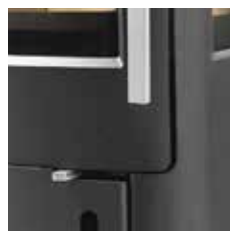
Adjustment of the air supply with one handle