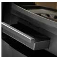
Large capacity ash pan