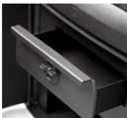
Large capacity ash pan

The Aura range features high-quality cast iron doors, top plate, grate and base, alongside an integrated log store and options for both top and rear exit.