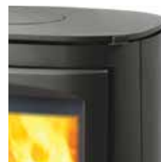
Elegant rounded corners