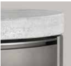
Accessory: Soapstone top