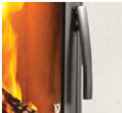
Ergonomically designed handle