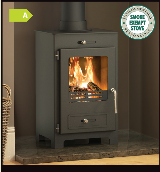
SILVERDALE 5 SE 5kw multifuel stove