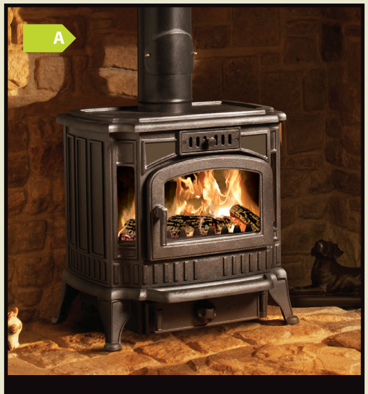
WINCHESTER 8.5kW MULTIFUEL STOVE