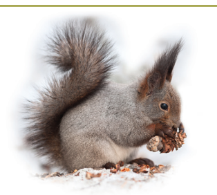
THE ENVIRONMENTAL CHOICE That's what you make when you burn wood in a Broseley stove good for the planet as well as great for the home.