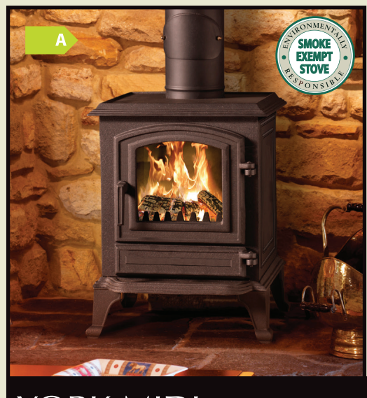
YORK MIDI 5kw multifuel stove